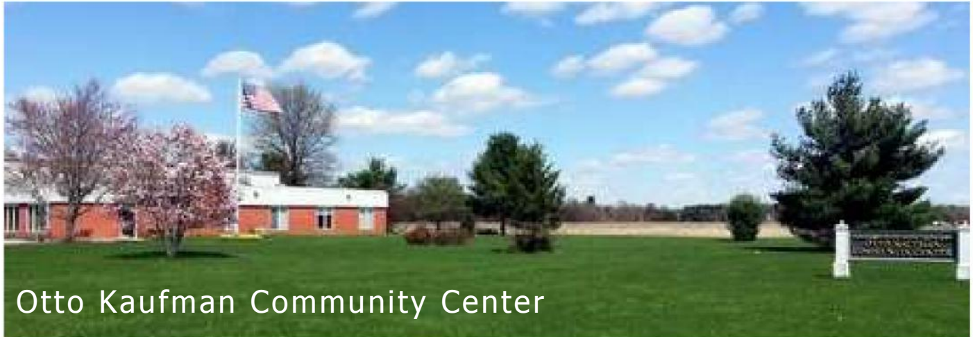
Otto Kaufman Community Center