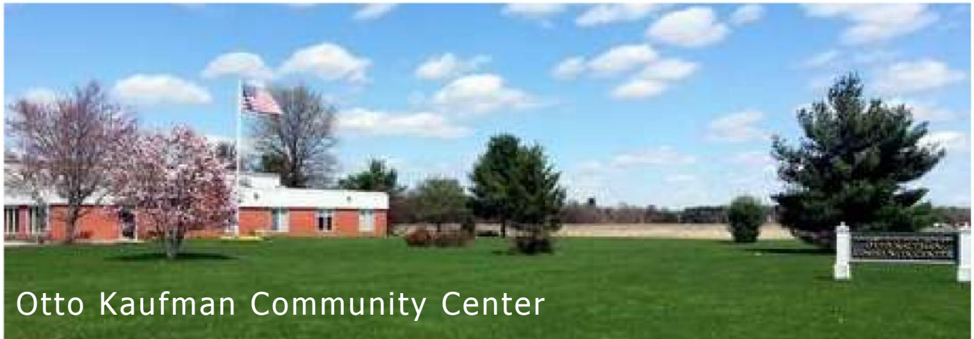
Otto Kaufman Community Center